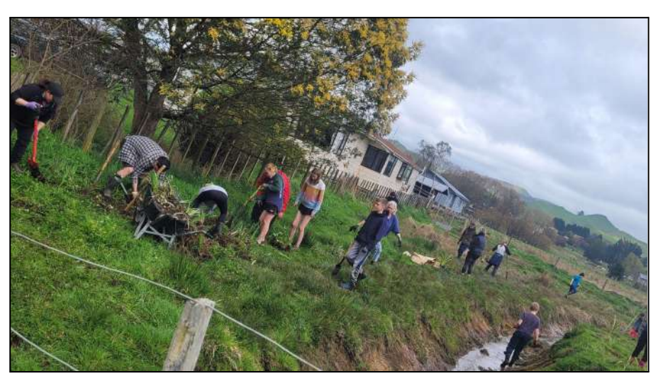
Years 7-8 Science Workshop Day