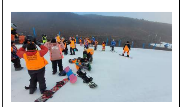
Education Outside the Classroom Classroom Snowsports