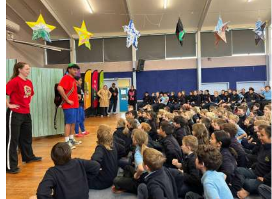
Duffy Theatre: Celebrating 30 Years inspiring the love of books in Duffy children so they become adults who inspire a love of reading.